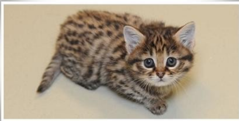
World first: Crystal the African black-footed cat

Cats' eyes are amazing instruments – they enable cats to pick up tiny movements to locate their prey and give them great night vision for hunting. One of the keys to this is the pupil which can be wide open or closed down to a very thin slit. In this way the eye can control the amount of